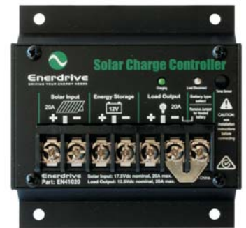
12V 20A Solar Charge Controller EN41020

Dimensions: 10.5 x 10.5 x 3.4 cm (L x W x H)