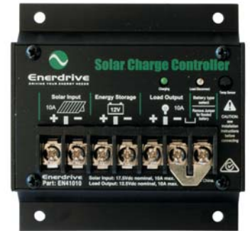
12V 10A Solar Charge Controller EN41010